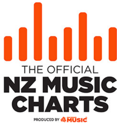
CHART RULES (as at July 2018)